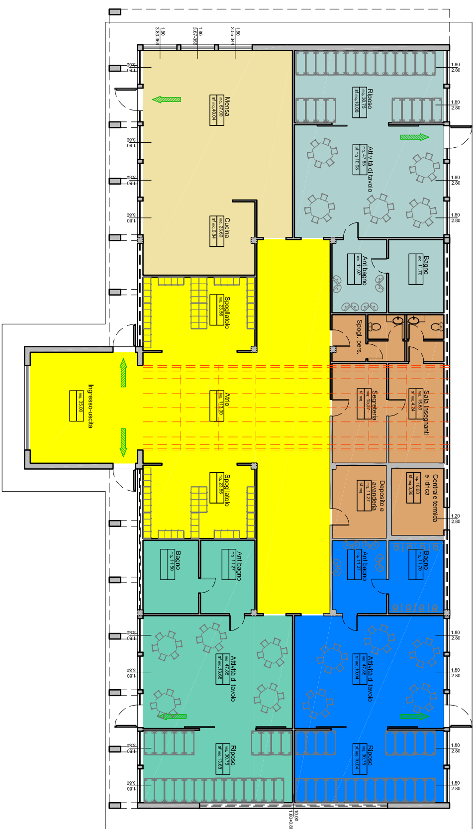
PIANTA PIANO TERRENO 1/200