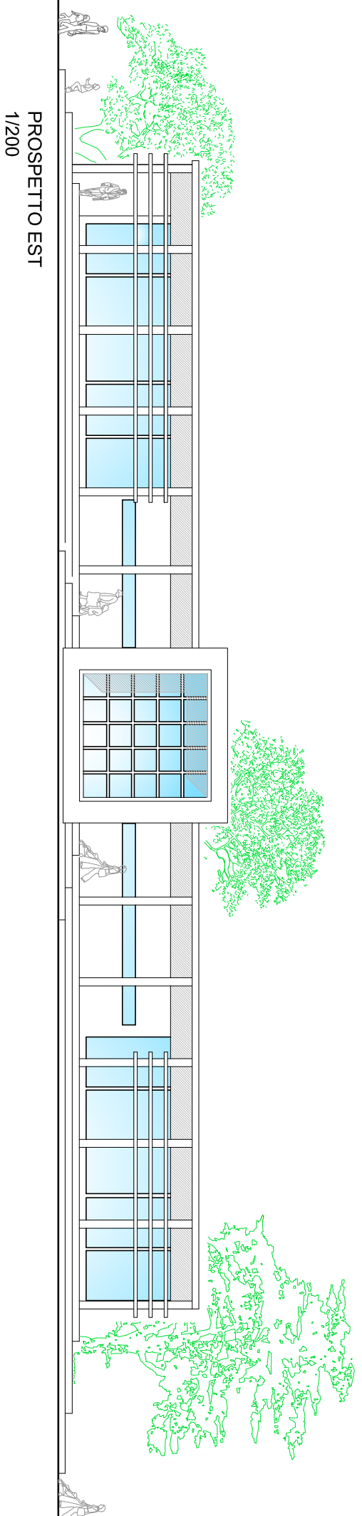
PROSPETTO EST 1/200